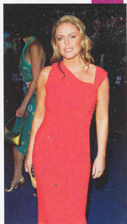
Patsy Kensit Trim